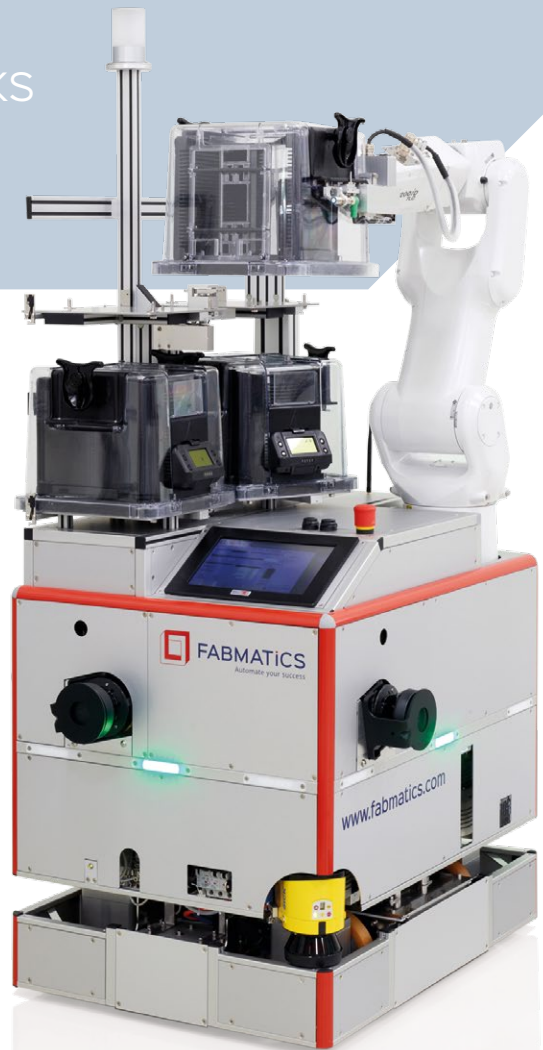
HERO®FAB 200 with 4 buffer positions for SMIF pods