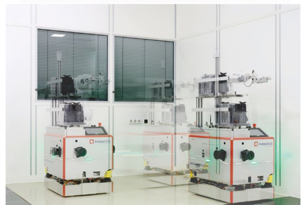
Omni-directional drive technology for moving in confined spaces