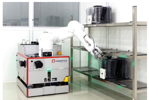
HERO®FAB 300 loading 3 rack levels